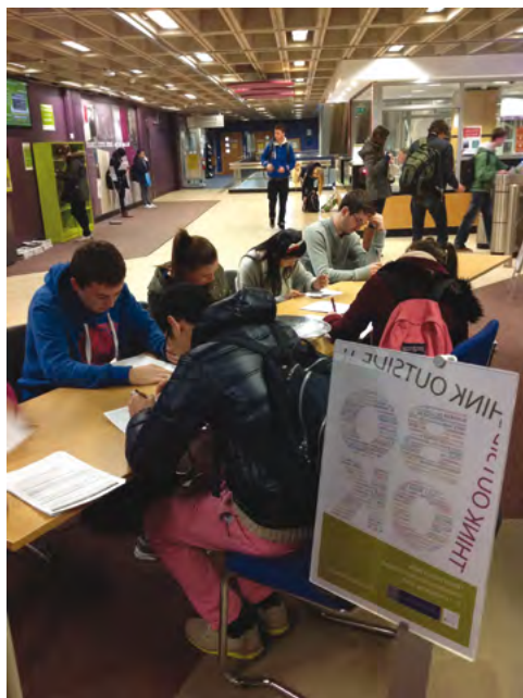
Library Ireland Week at UCD.