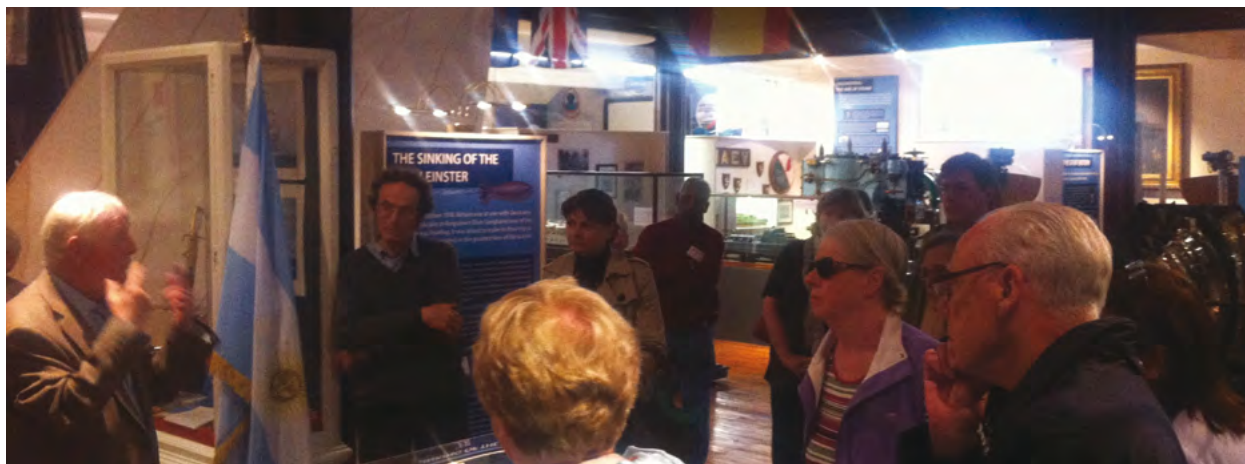
Visit to the National Maritime Museum of Ireland.

Terrace, Dún Laoghaire, on the 27th June, was attended by 25 members. The Museum is located in the old Mariners' Church, which was built in 1837 especially for the sailors of the Royal Navy and for the people using the harbour. The church has been extensively renovated and converted into a museum. The Museum was officially opened by the President of Ireland on the 5th June 2012.