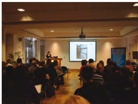
Tina Byrne of Arcline speaking at the CDG open day