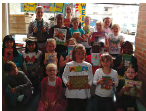
Summer Reading Camps for DEIS Schools