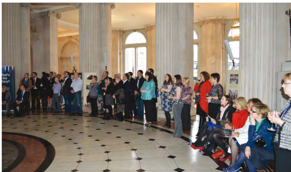
Conference delegates attending the reception at Dublin's City hall, hosted by Dublin City Council, on 10th April 2013.