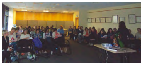
Delegates at the Recommending with Confidence seminar.