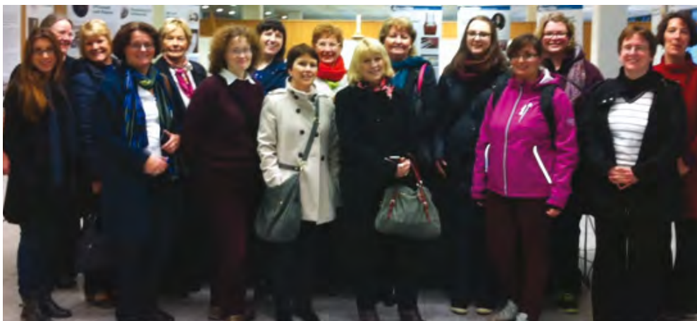
Visit to the new John Paul II Library in NUI Maynooth