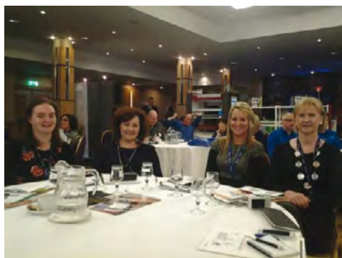
Delegates from Dublin City Public libraries, Limerick City and Limerick County Libraries at the Public Libraries Conference.

reviewed the Report's 30 recommendations which are grouped under three strategic aims: identify champions and promote visibility; build a body of evidence; and staff and service development.