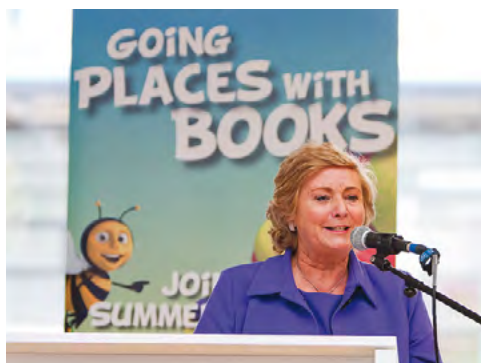
Minister of Children and Youth Affairs, Francis Fitzgerald, T.D., launches the summer Reading Buzz at Tallaght Library.