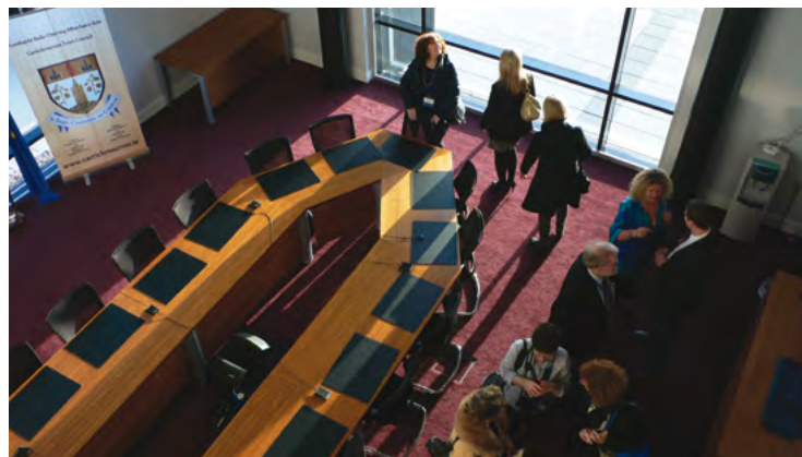
Delegates visit Carrickmacross Library

The committee would like to thank Monaghan County Libraries for all their help and support in making this conference a success and a special thanks to all our sponsors and friends in the trade who made the conference most enjoyable.