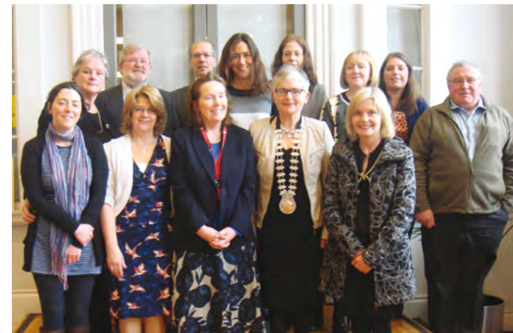
Members of Council at the AGM in Pearse Street Library.

The 2013/14 Council met seven times during its term of office to the end of December – 25th April, 23rd May, 27th June, 26th September, 24th October, 21st November, 12th December. The previous Council met twice in 2013 – 10th January and 14th February.