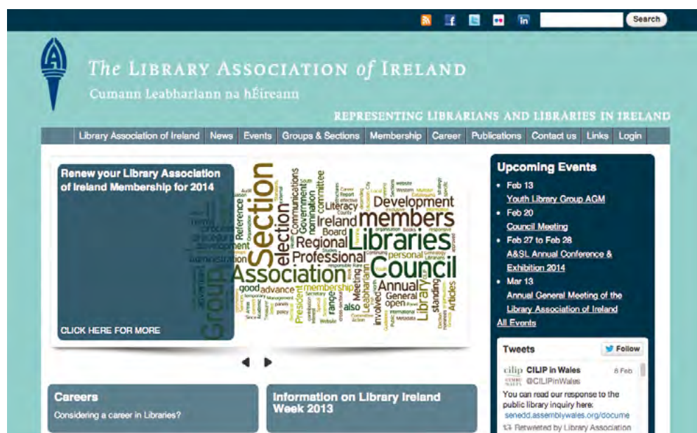
Library Association of Ireland website.

Library Ireland Week : promotional materials.