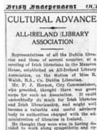
Contemporary reports of the formation of the LAI in 1928